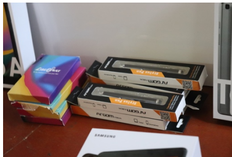
Some digital devices