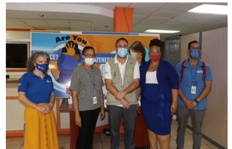
WFP Team with PS & SAS of MONM